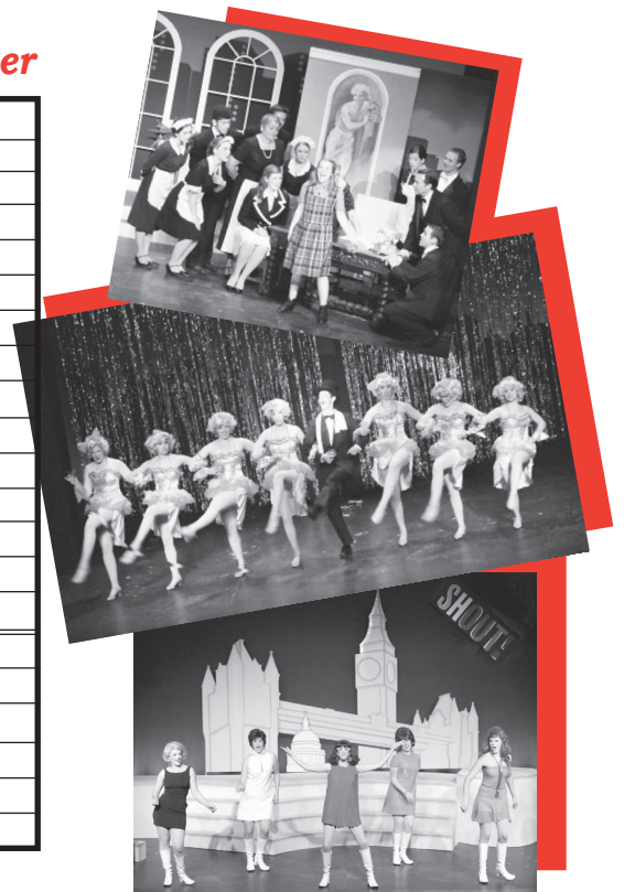
SCENES FROM OUR 2010 SHOWS (TOP TO BOTTOM: ANNIE, PRODUCERS, SHOUT)

Flexiticket (Ex Saturday) F Use 5 tickets for any show, any date, any time. * Indicates this is not a regular Subscription Performance Week